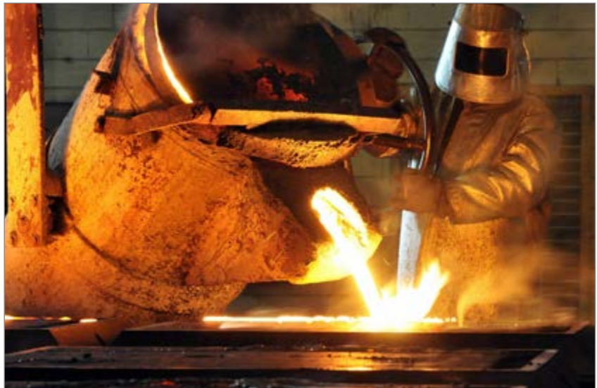
Figure 2. Romi Foundry, Brazil

From this point Romi will be looking for castings that lie at the limits of their specifications and using FERROLAB V will create systems allowing them to move the quality even closer to their target.