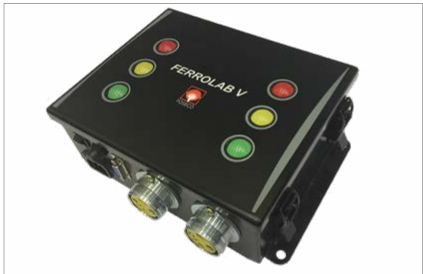
Figure 1. FERROBOX data acquisition unit

The system is provided free of charge to Foseco customers that buy our inoculants, nodularisers and sampling cups. And we work together with them to ensure that they can consistently produce the highest quality iron possible.