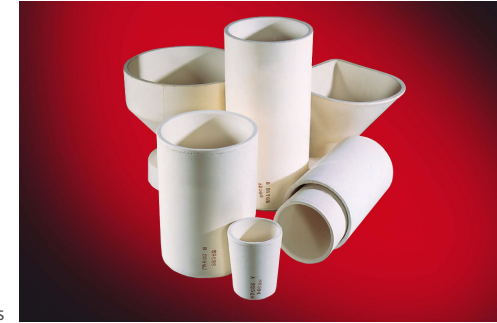
One Shot Liners