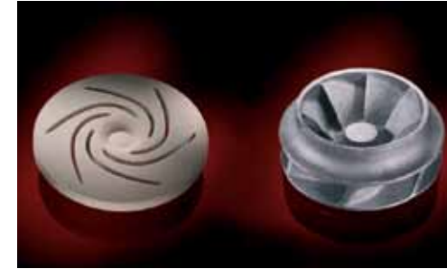
Impeller for high-efficiency centrifugal pumps

Binder bridges in the ECOLOTEC process are more elastic than in many other core-making processes. Hence casting defects related to sand expansion, such as veining, are significantly suppressed or eliminated and anti-veining additives are usually not required to obtain sound castings.