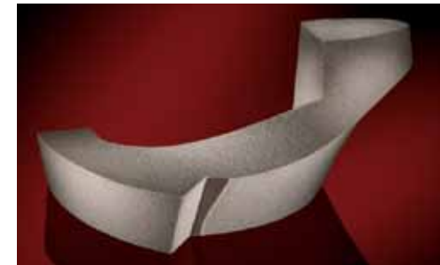
Segment for an impeller for a sea water desalination plant