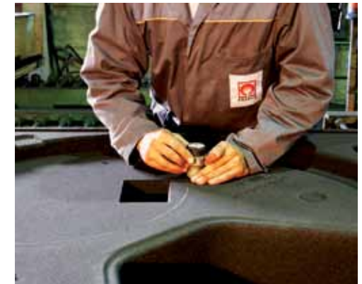
Strength check on cured mould and core