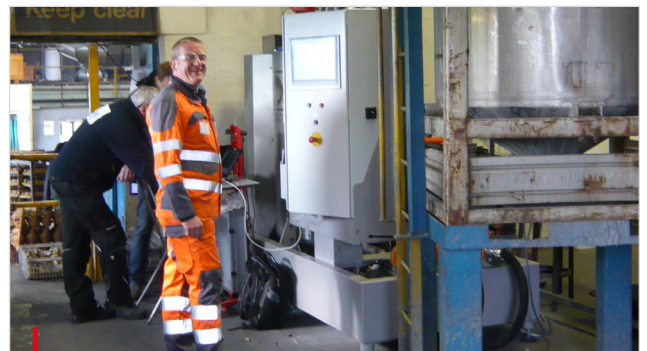
ICU connected to container - automating preparation and application