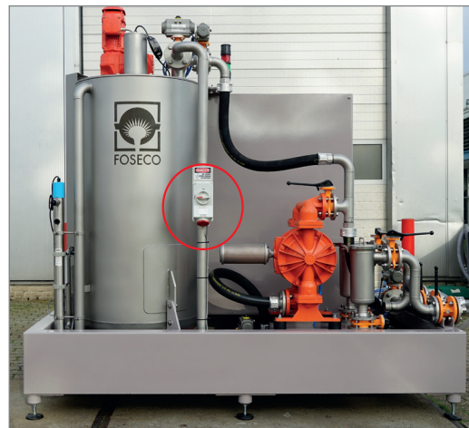
Figure 4. Integrated timer control