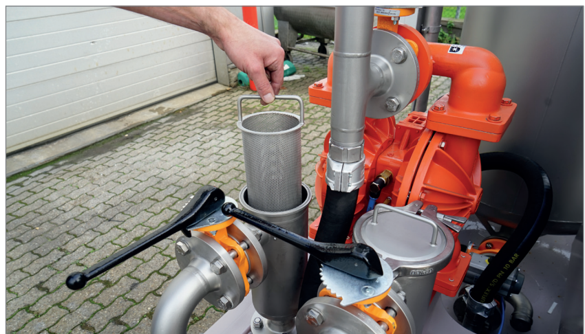
Figure 6. ICU Filter system

The accurate and fast determination of the density enables the ICU to quantify the re-quired volumes of raw coating or respectively dilution medium in advance and replenishment can take place without delay.