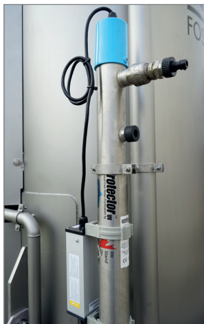
Figure 3. Optional UV treatment