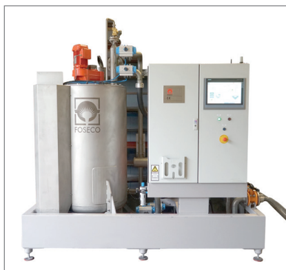
Figure 1. ICU - Intelligent Coating Unit