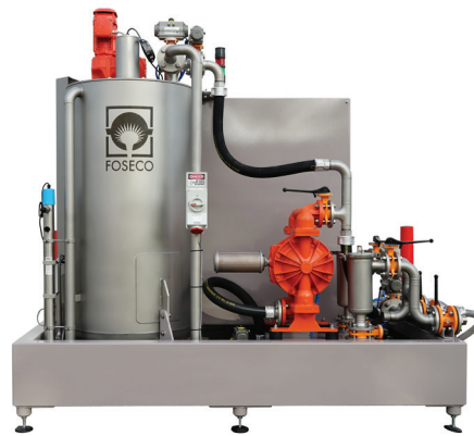
Foseco's fully automated Intelligent Coating Unit: Controls coating density in real-time and therefore delivers greater consistency in wet layer thickness.