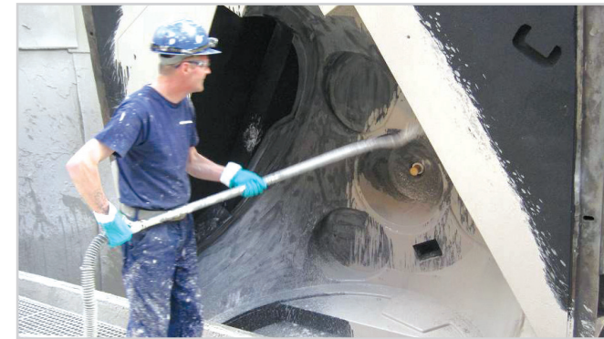
Flow coating application