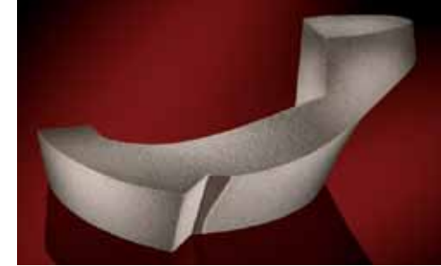
Segment for an impeller for a sea water desalination plant