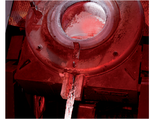
Crucibles are used for melting and holding

For detailed application information please refer to the individual product datasheets.