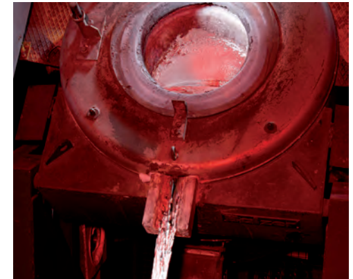
Crucibles are used for melting and holding

For detailed application information please refer to the individual product datasheets.