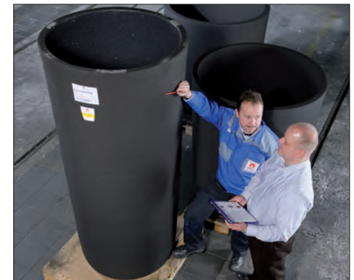
Tailor made crucibles are available