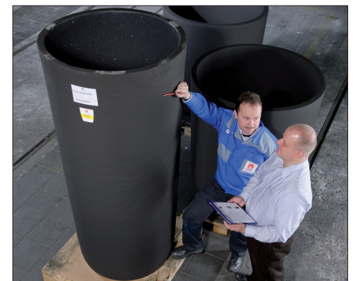
Tailor made crucibles are available