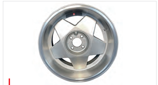
Example of an aluminium wheel