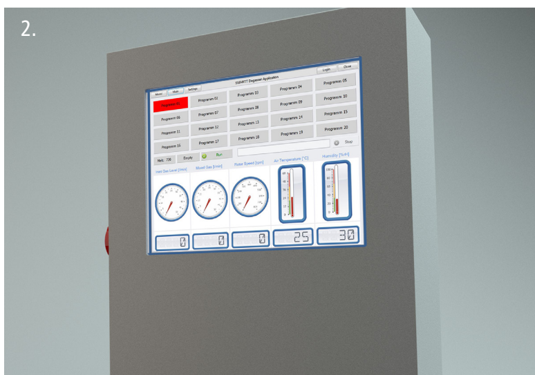
(1) Foseco's MTS treatment station (2) Operator screen of new SMARTT degassing process control software unit