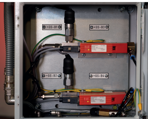
Mass flow controllers