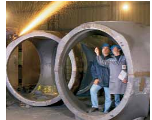
Compliant to the highest casting quality demands

CATASET are a range of acid catalysts for ESHANOL & FUROTEC furane binders. Minimal addition rates are required. Sand bench life and curing time can be optimised to suit the foundry requirements. In combination with the DUOMIX online set time control unit, the highest degree of possible productivity combined with lowest mould and core manufacturing costs, can be ensured.