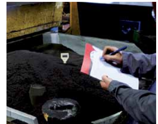
Mixed sand bench life control