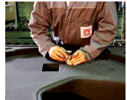
Strength check on cured mould and core