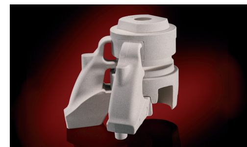
Component of rear axle core package