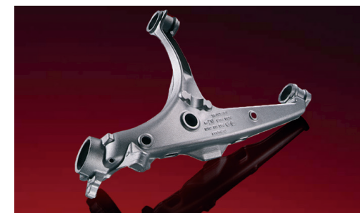
Rear suspension arm made by means of a core containing NORACEL W